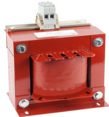
DC link choke

These custom-built three-phase DC link chokes are connected between the rectifier and the DC bus and can be used to remove unwanted harmonics. They can be more or less effective than AC line reactors depending on the harmonics in the line and they add the necessary impedance for harmonic reduction without a drop in voltage. DC link chokes can also protect against current surges. Units can be produced to customers' own drawings and requirements.