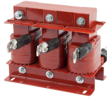
3ph output choke

Designed to customer requirements using either our standard design or customers' own drawings or specifications.